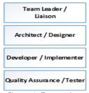
Figure 4. Team roles.

Most of the systems involve one or more of the following: programming, a database, a computer network, a Web interface. Java is the preferred language for projects that require programming. Non-programmers or weak programmers can contribute in many ways other than programming. A team usually consists of 3-5 students - an Architect-Designer, one or two Developers-Implementers, a Quality Assurance-Tester, and a team Leader-Liaison (Figure 4). For small teams several team member functions can be combined.